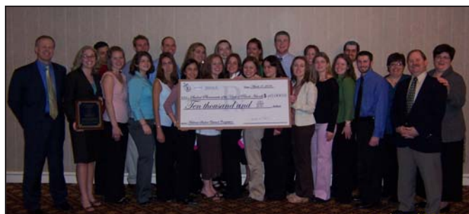
URI College of Pharmacy students and RIPA Leadership pose with the $10,000 first prize for Medicare Part D outreach

As with every annual meeting, receptions were plentiful. The New England Reception, cosponsored by RIPA, had a spectacular turnout. Greetings were given by all states to an attendance of well over 60 people.